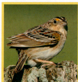
Grasshopper sparrow ( Ammodramus saviannarum )

Trailhead 625 Canal Road. Blackwells Trail meanders through fields full of goldenrod and milkweed, providing an excellent area to view grassland birds and butterflies. The trail then winds through the upland forest where mayapples, shagbark hickory and spicebush are abundant. Near the end, the trail crosses a marsh on a 150' elevated wooden boardwalk, and then runs alongside the Six Mile Run creek before crossing over the stream on a metal bridge and joining the Creek Trail.